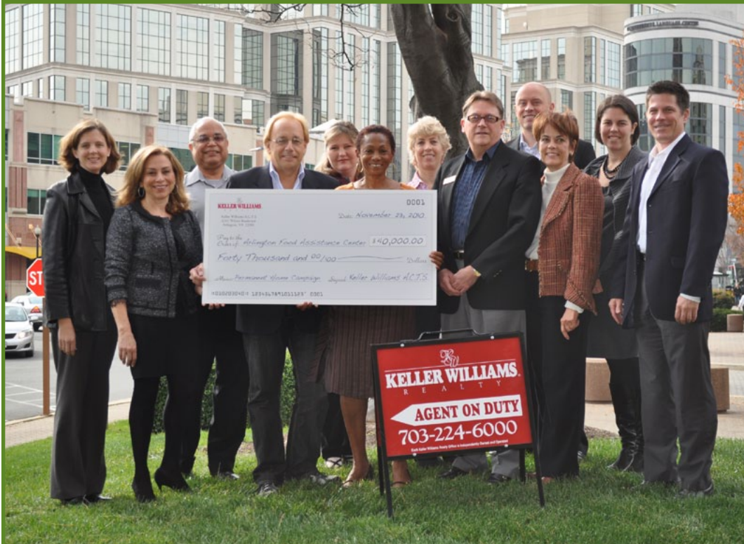
A special thank you to Keller-Williams Realty, Arlington (KWACTS) for hosting a fabulous fundraiser for the Permanent Home Campaign for the last three years. Their efforts have generated over $100,000 for the Campaign!